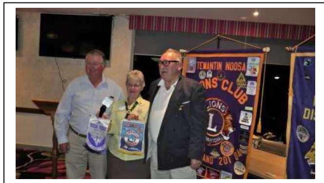
“The chaplaincy girls”