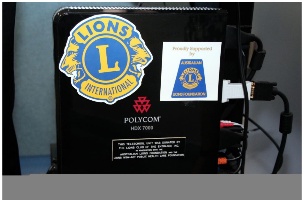
One of two Teleschool Units presented by the Lions Club "The Entrance" (N3) to the RIDBC Hunter

Remember the "Australian Lions Foundation" is YOUR Foundation